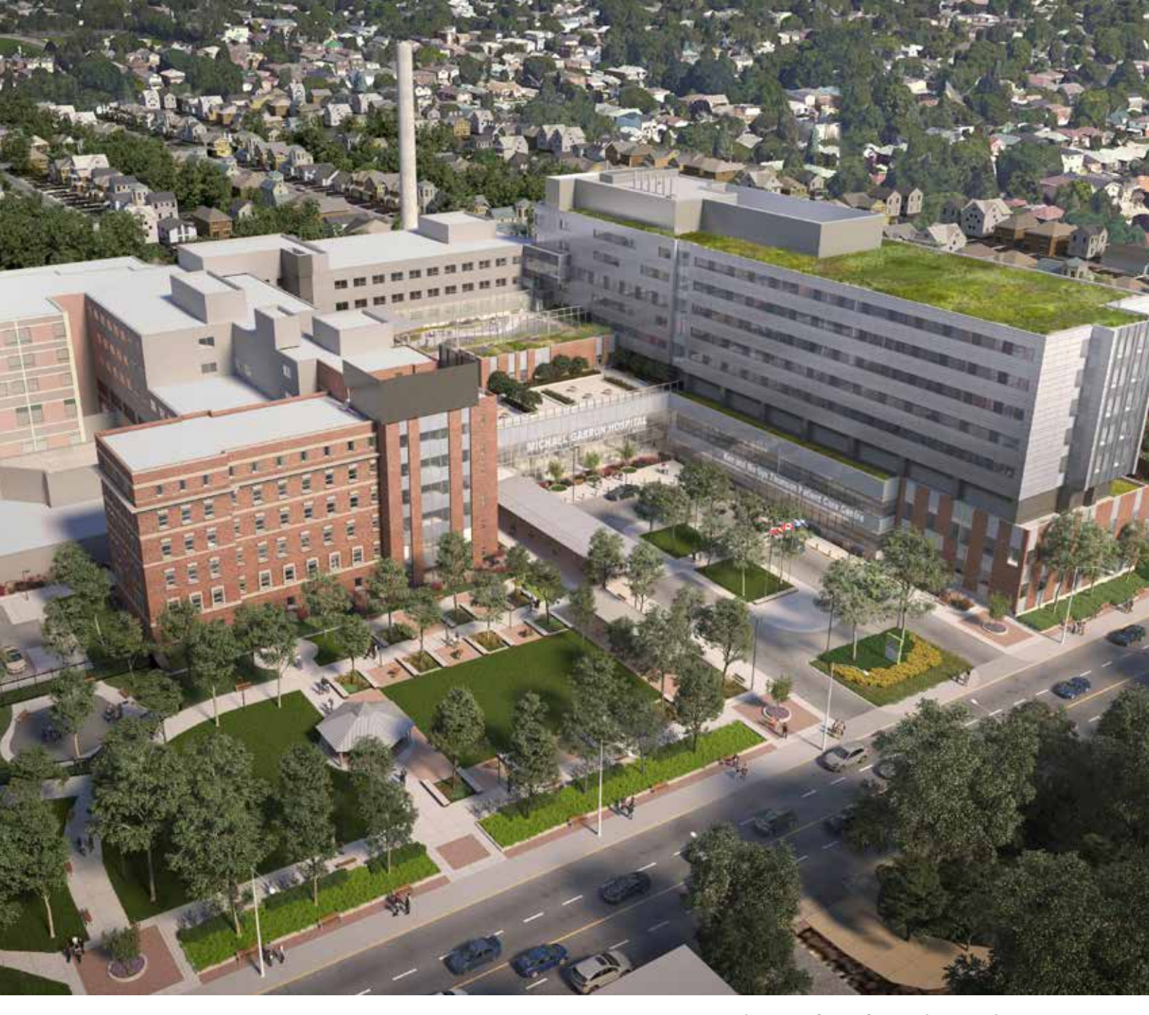
Rendering of our future hospital campus