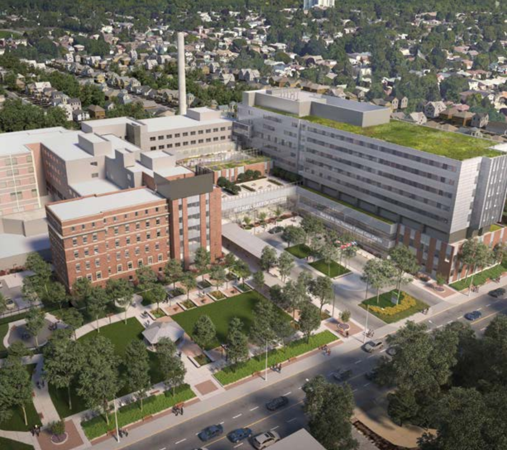
Rendering of new hospital campus, completion 2024