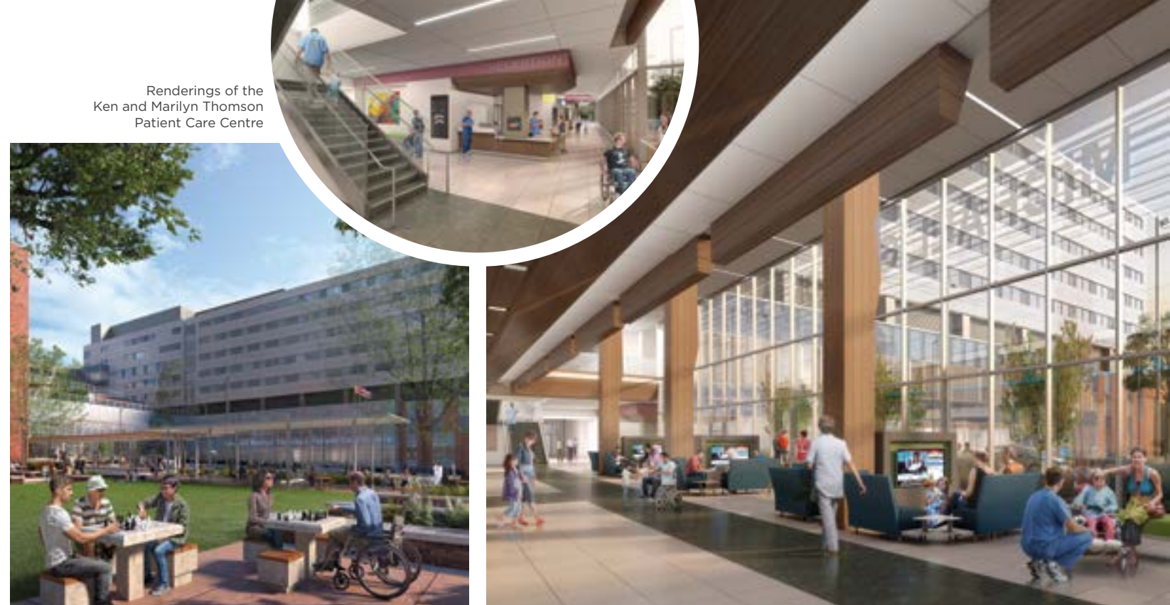
Renderings of the Ken and Marilyn Thomson Patient Care Centre

“We want to help ensure everyone in our diverse east end community has better health outcomes and with that, a stronger ability to thrive. From the Heart struck a chord; it gave us the chance to play a meaningful role in the hospital’s new chapter.”