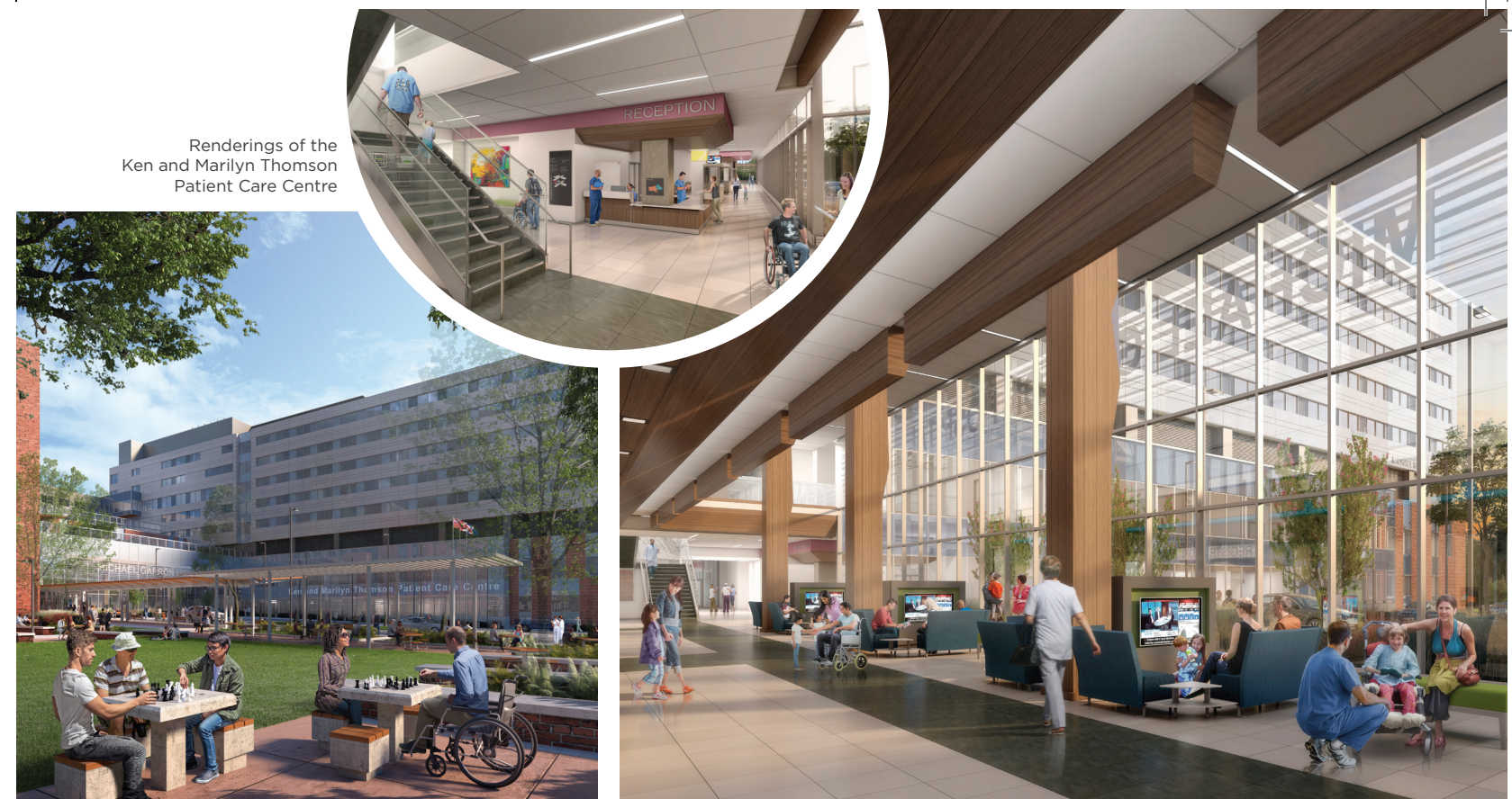
Renderings of the Ken and Marilyn Thomson Patient Care Centre

Join the From the Heart program at the $5,000, $10,000 or $15,000 level and your generosity will be celebrated with a personalized glass orb. Text of your choice will be engraved to recognize your support, honour someone special, or commemorate an occasion.