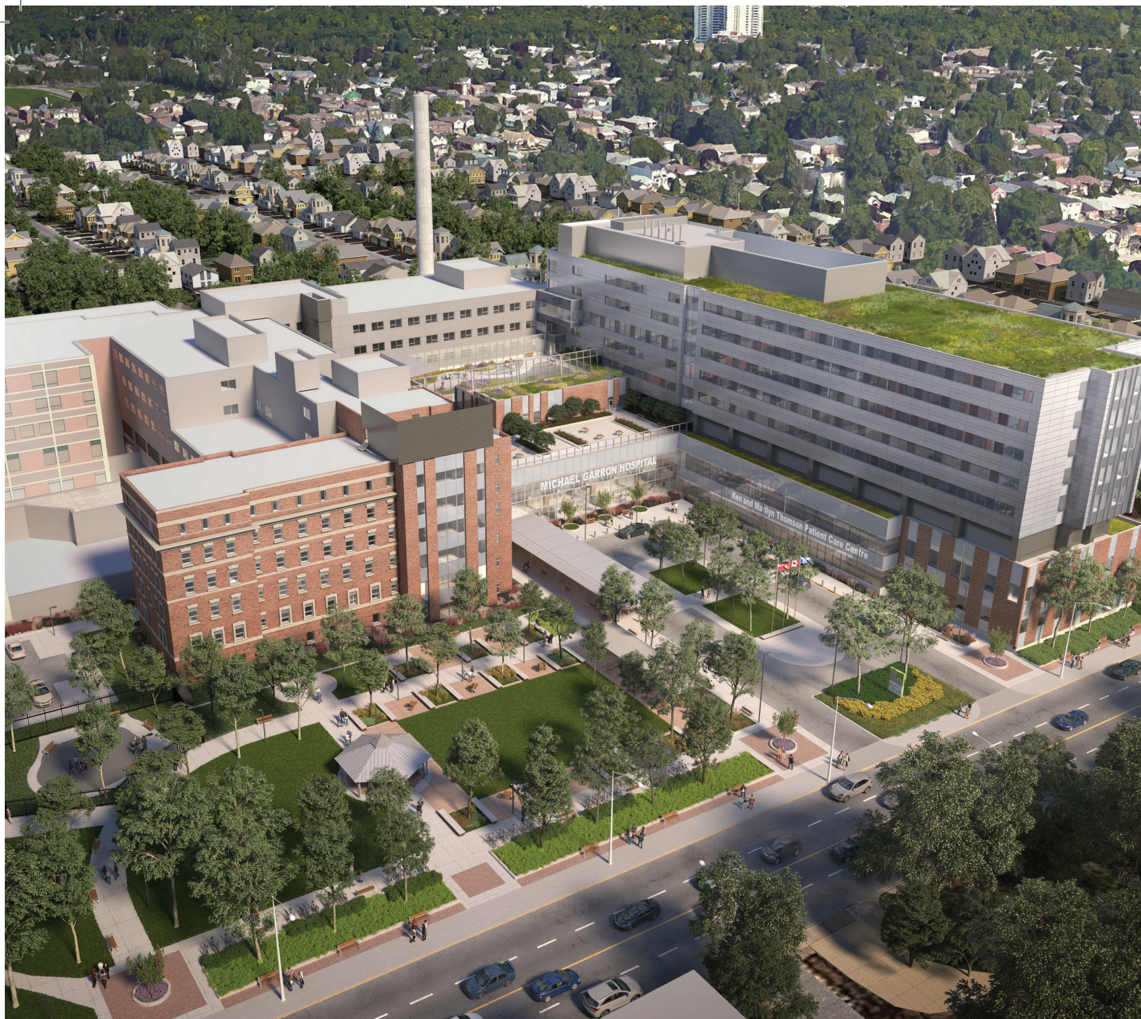
Rendering of new hospital campus, completion 2024